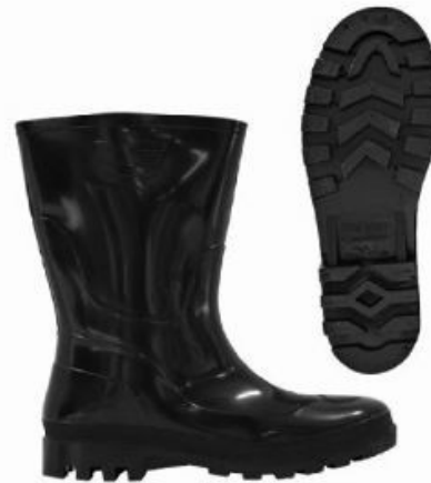
Fielder Unisex Mid Calf Gumboot General Purpose Gumboot