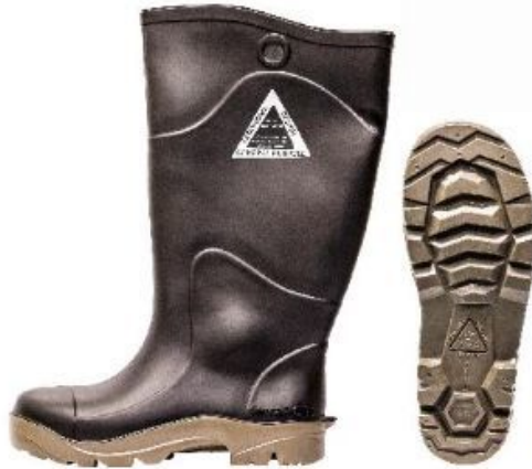
Bellator S4 (CE) Steel Toe Cap (STC) Kick Plate