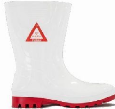
Fielder (CE) Unisex Mid Calf Gumboot Available with anti-bacterial protection