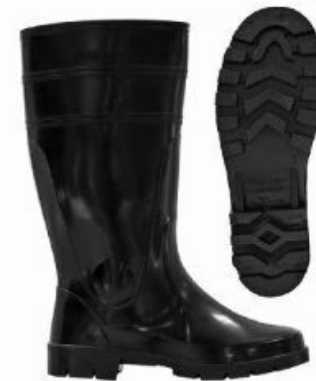
Builder Men's Knee Length Gumboot General Purpose Available with anti-bacterial protection

ALL OUR PVC GUMBOOTS ARE MADE WITH PHTHALATE-FREE VIRGIN MATERIAL