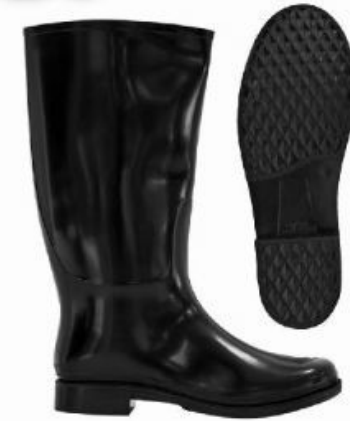
Snooty Ladies General Purpose Gumboot