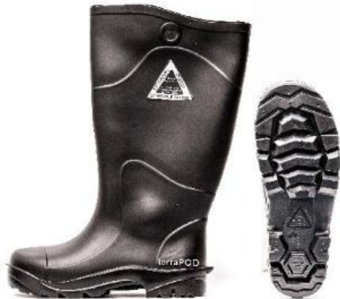
Invictus S5 (CE) Steel Toe Cap (STC) Steel Mid Sole (SMS) Kick Plate