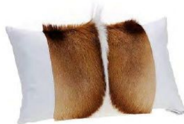
CUSHION - ICE-WHITE H 30 W 50