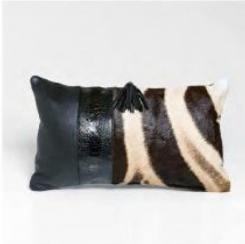
CUSHION - ZEBRA - OSTRICH SHIN H 30 W 50CM