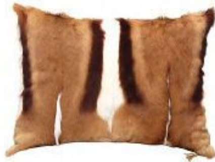
CUSHION - NATURAL SPRINGBOK H 40 W 40CM