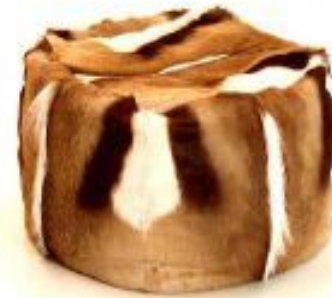
BEANBAG - FULL NATURAL SPRINGBOK H 45 W 45 D 45CM