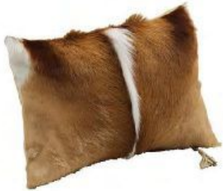
CUSHION - NATURAL SPRINGBOK H 30 W 40CM