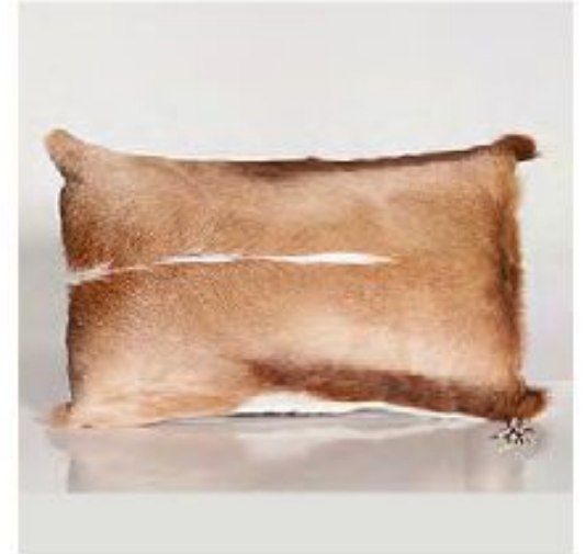
CUSHION - NATURAL SPRINGBOK H 38 W 57CM