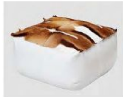
FLOOR CUSHION NATURAL SPRINGBOK TOP LEATHER SIDES H 80 W 80 D 40CM