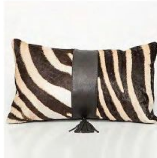
ZEBRA-BLACK -LEATHER-CUSHION H 30 W 50CM