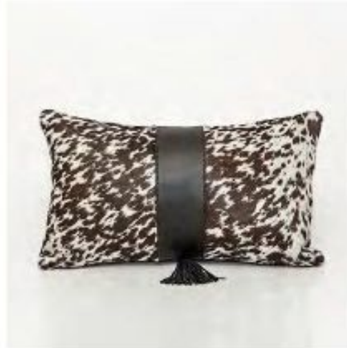
CUSHION - COWHIDE - 3 PANEL H 30 W 50CM