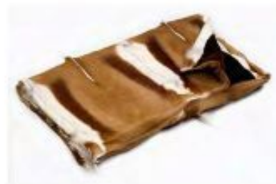
THROW - 12 SKINS SUBJECT TO SKIN SIZE