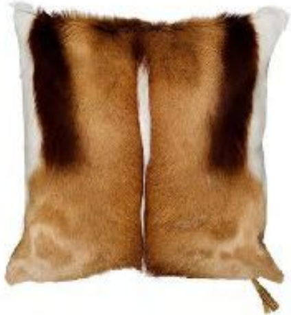
CUSHION - NATURAL SPRINGBOK H 40 W 40CM