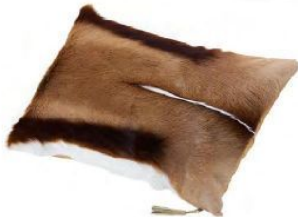
CUSHION - NATURAL SPRINGBOK H 38 W 57CM