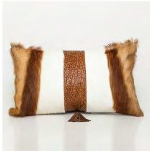
CUSHION - NATURAL SPRINGBOK -EROVA LEATHER H 30 W 50CM