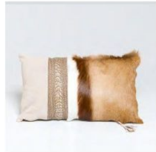
CUSHION - NATURAL SPRINGBOK - OSTRICH SHIN H 30 W 50CM